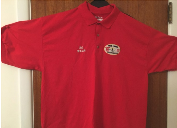
Gildan 8800 DryBlend Jersey Sport Shirt