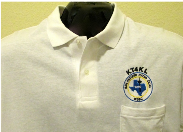
Gildan 8900 Solid Color Polo Shirt

Polo shirt Short sleeves Left chest pocket