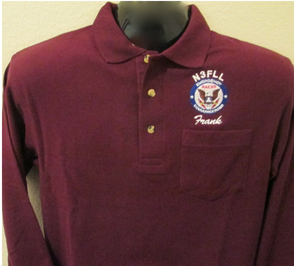
TM 609 Knit Golf Shirt

Pique Golf Shirt Long sleeves Left chest pocket 60% Cotton 40% Polyester 8.2 oz. knit Square-hemmed bottom S M L XL 2XL + $2 3XL + $3 4XL + $4 5XL + $5 6XL + $6 Also LT thru 6XLT