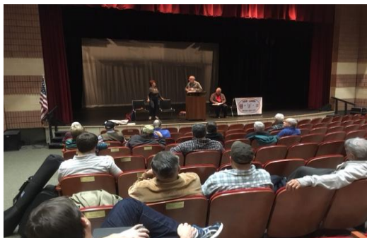
The January 2016 Business Meeting in the auditorium.