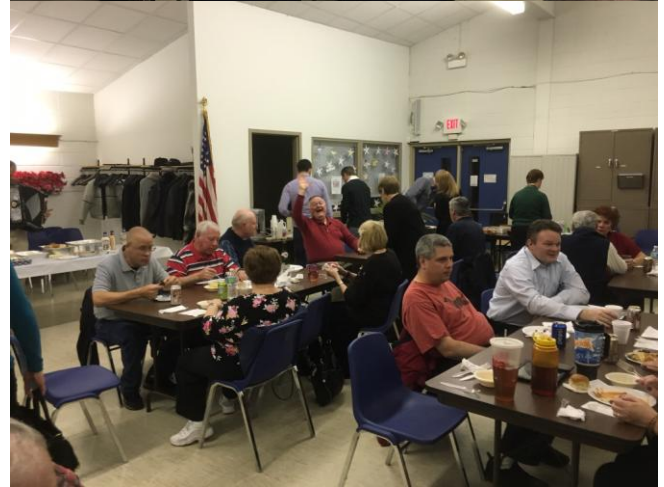
2015 Holiday Party at the Senior Center